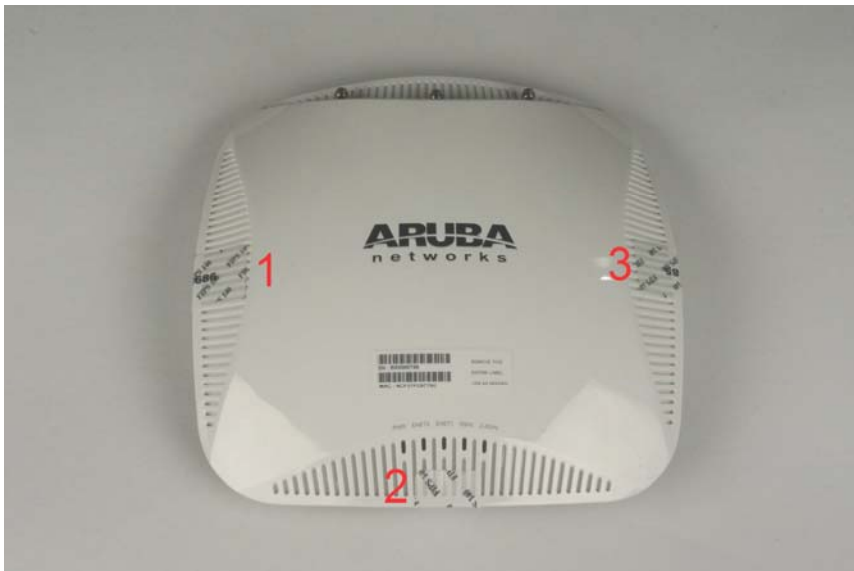
Figure 1: AP-224/225 Front/Top view

Following is the TEL placement for the AP-224/225: